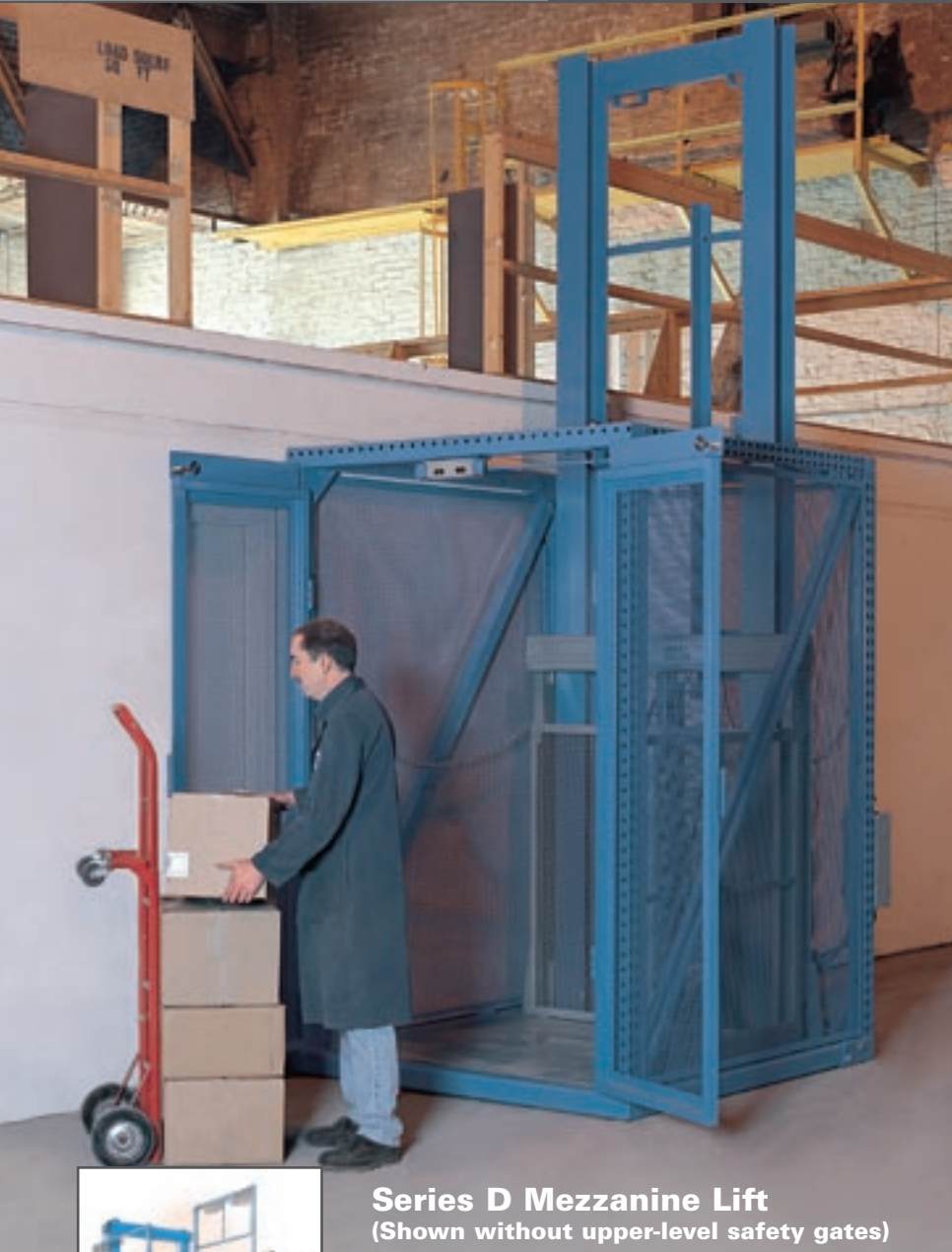
Series D Mezzanine Lift (Shown without upper-level safety gates)

As an option, the Pflow Series D Lift can be shipped as a self-contained unit equipped to service in-plant mezzanines. The Pflow Series D Mezzanine Lift is pre-assembled and shipped with lower-level enclosures and code-approved safety gates. The lift motor pump and controls are pre-wired for fast, easy, one-day installation.